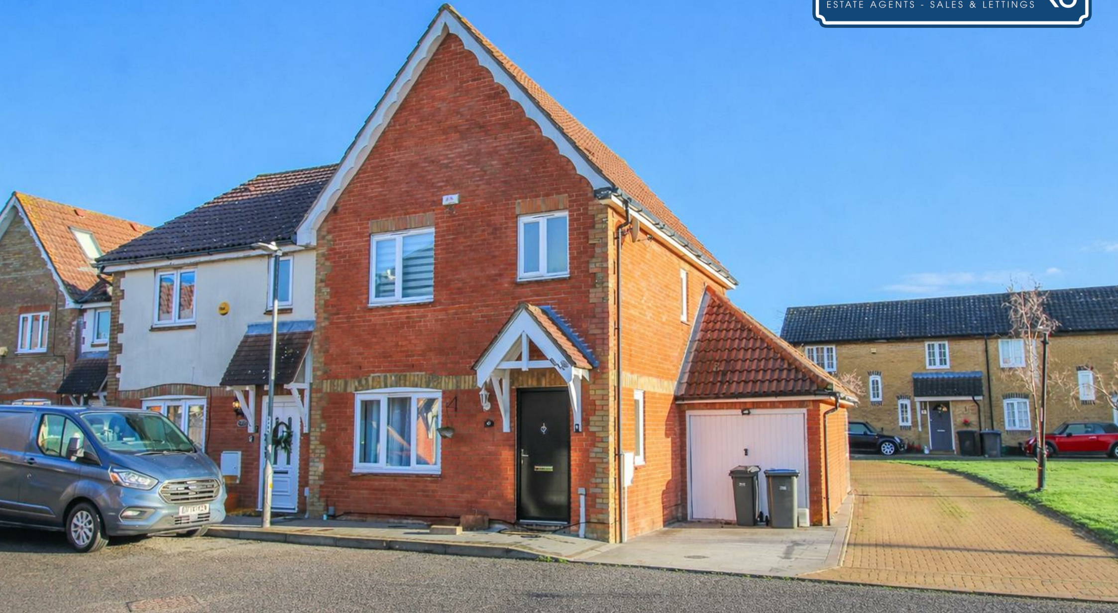
Aynsley Gardens, Church Langley, CM17 9PB Guide Price £425,000